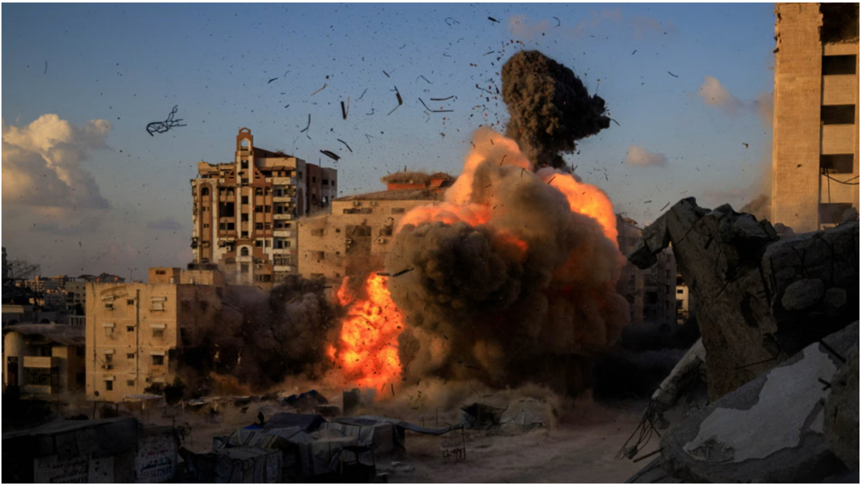
The Democratic News | Gaza, Oct 28:

The Israeli regime's Prime Minister, Benjamin Netanyahu, has ordered the military to carry out immediate "powerful" strikes on Gaza as Israel continues to violate the ceasefire agreement in the besieged territory. The regime has broken the ceasefire over 125 times in