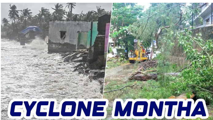
The Democratic News | Amaravati, Oct 28:

Cyclone Montha made landfall near Kakinada on Tuesday, bringing strong winds and heavy rainfall