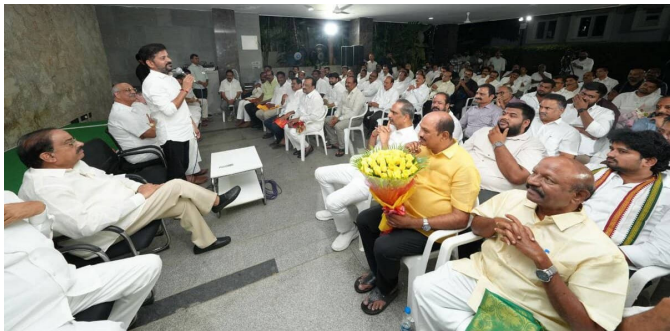
The Democratic News | Hyderabad, Oct 28:

Community members who met the CM also appealed to give due priority to the community in the nominated posts in the government.