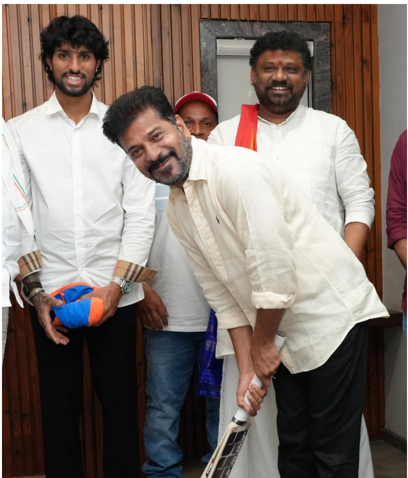
The Democratic News Hyderabad, Sep, 30

Rising Indian cricket star Tilak Verma paid a courtesy visit to the Hon'ble