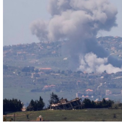
The Democratic News Lebanon, Apr, 29

April 16 after weeks of fighting between the Tel Aviv regime and Hezbollah.