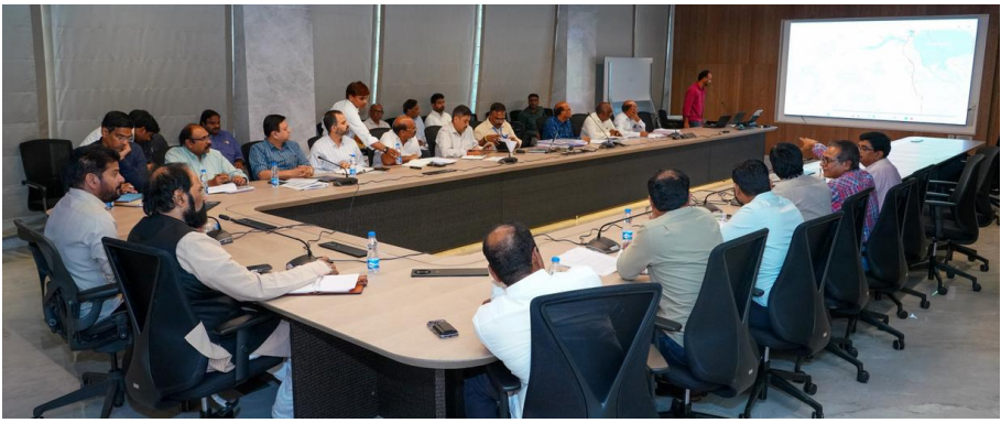
The Democratic News Hyderabad, Apr, 29

In a bid to construct Tummidihatti barrage, the State government has proposed to reduce its height to 150 metres and improve water utilisation, while reducing submergence in