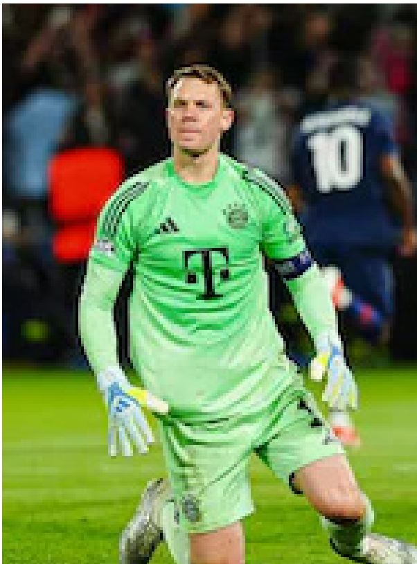
It was chaos, quality, and relentless attacking from both sides. But once the dust settled on Bayern Munich's

After PSG's 5-4 rout of Bayern, Neuer is now the first goalkeeper ever in UCL history to concede 5 goals in a knockout match and not make a single save.