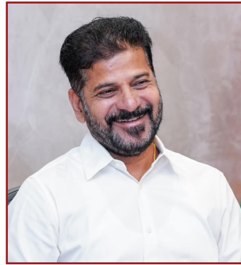
The Democratic News Hyderabad, May, 27

Chief Minister Revanth Reddy extended heartfelt greetings to Muslims on the occasion of Eid al-Adha, describing the festival as a symbol of selflessness, sacrifice,