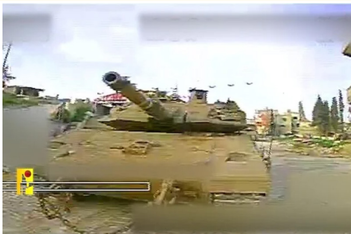
In previous rounds, the Israeli army had freedom to operate and launch attacks anywhere in southern Lebanon," an Israeli soldier on his third