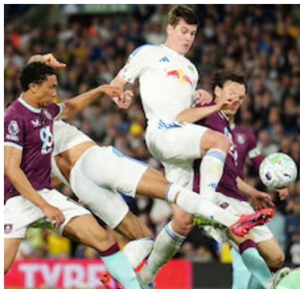
Look away, Spurs fans. Ain't nothing getting pretty for y'all. Leeds United took a big step toward Premier League survival with a 3-1 win over

Goals from Anton Stach, Noah Okafor and Dominic Calvert-Lewin move Daniel Farke's Leeds nine points clear of the PL drop zone.