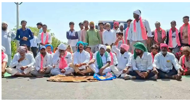
The Democratic News Hyderabad, May, 02