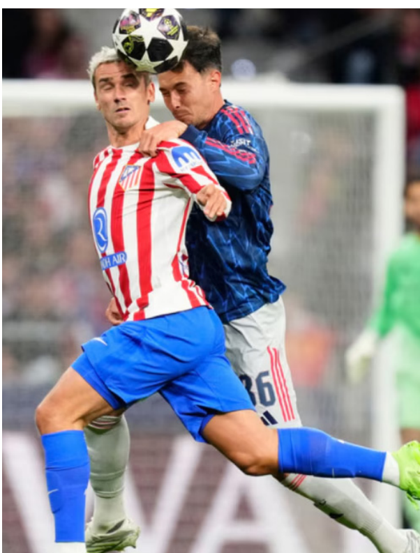
Nottingham Forest moved closer to a historic European final with a 1-0 victory over Aston Villa in the first leg of

Nottingham Forest beat Aston Villa 1-0 in the UEFA Europa League semi-final first leg, while S.C. Braga edged SC Freiburg 2-1 with a stoppage-time winner.