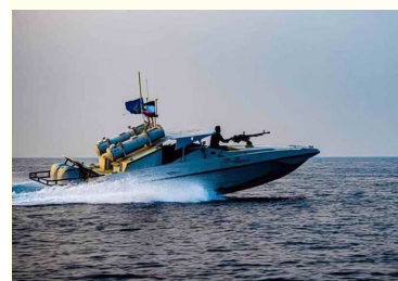
The Democratic News Tehran, May, 04

A senior Iranian military official has rejected a claim by the United States military that it has sunk several Iranian boats as part of an attempt to open the Strait of Hormuz, the IRIB News reports.