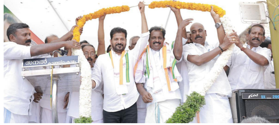
A Revanth Reddy posted on X

In Hyderabad, Telangana Chief Minister A Revanth Reddy on Monday congratulated senior Congress leaders including Rahul Gandhi and Mallikarjun Kharge, along with party activists, over the victory of the United Democratic Front (UDF) in Kerala CM also referred to his campaign in Kerala, his remarks against Chief Minister Pinarayi Vijayan, and the subsequent verbal exchange between the two leaders. The political developments are ongoing following the UDF victory. Revanth Reddy Congratulates Congress Leadership on UDF Win