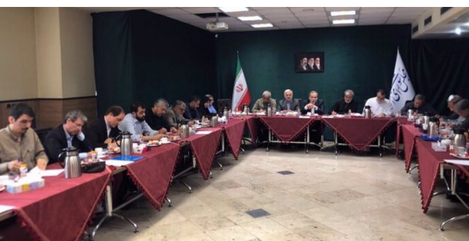
The Democratic News Tehran, May, 04

A senior Iranian lawmaker has quoted Foreign Minister Abbas Araghchi as saying that the Islamic Republic is not currently