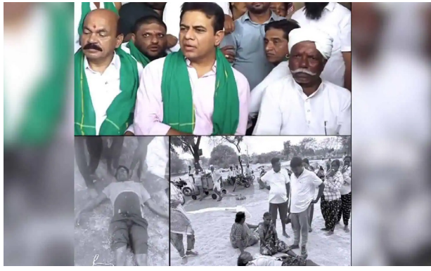
The Democratic News Hyderabad, May, 04

Two farmers died at procurement centres in Telangana on Sunday, May 3, leading the Opposition Bharat Rashtira Samithi (BRS) to hit out at the ruling Congress, accusing them of negligence and delaying pro-