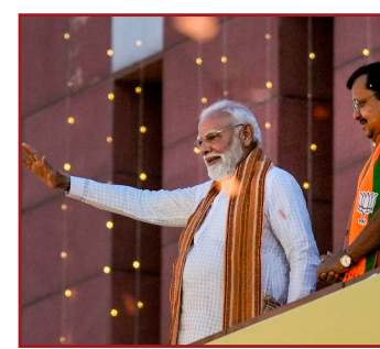
The Democratic News New Delhi, May, 04

Addressing Bharatiya Janata Party (BJP) workers at the party headquarters after the win in assembly elections in West Bengal, Assam and Puducherry, Modi said it was a special day in many