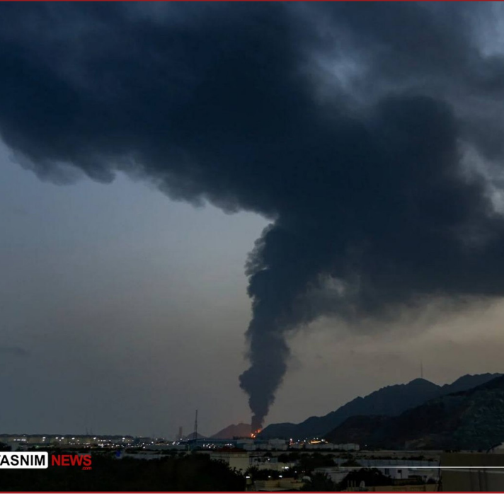
The Democratic News UAE, May, 04

The United Arab Emirates has claimed that its oil installations at the Port of Fujairah were targeted in an attack, allegedly carried out by Iran in response to US movements and Emirati support. The incident reportedly triggered a major fire at the site.